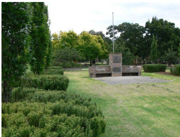
Richmond War Memorial

The Richmond War Memorial, located in Barkly Gardens, Coppin Street, Richmond does not contain any individual names.