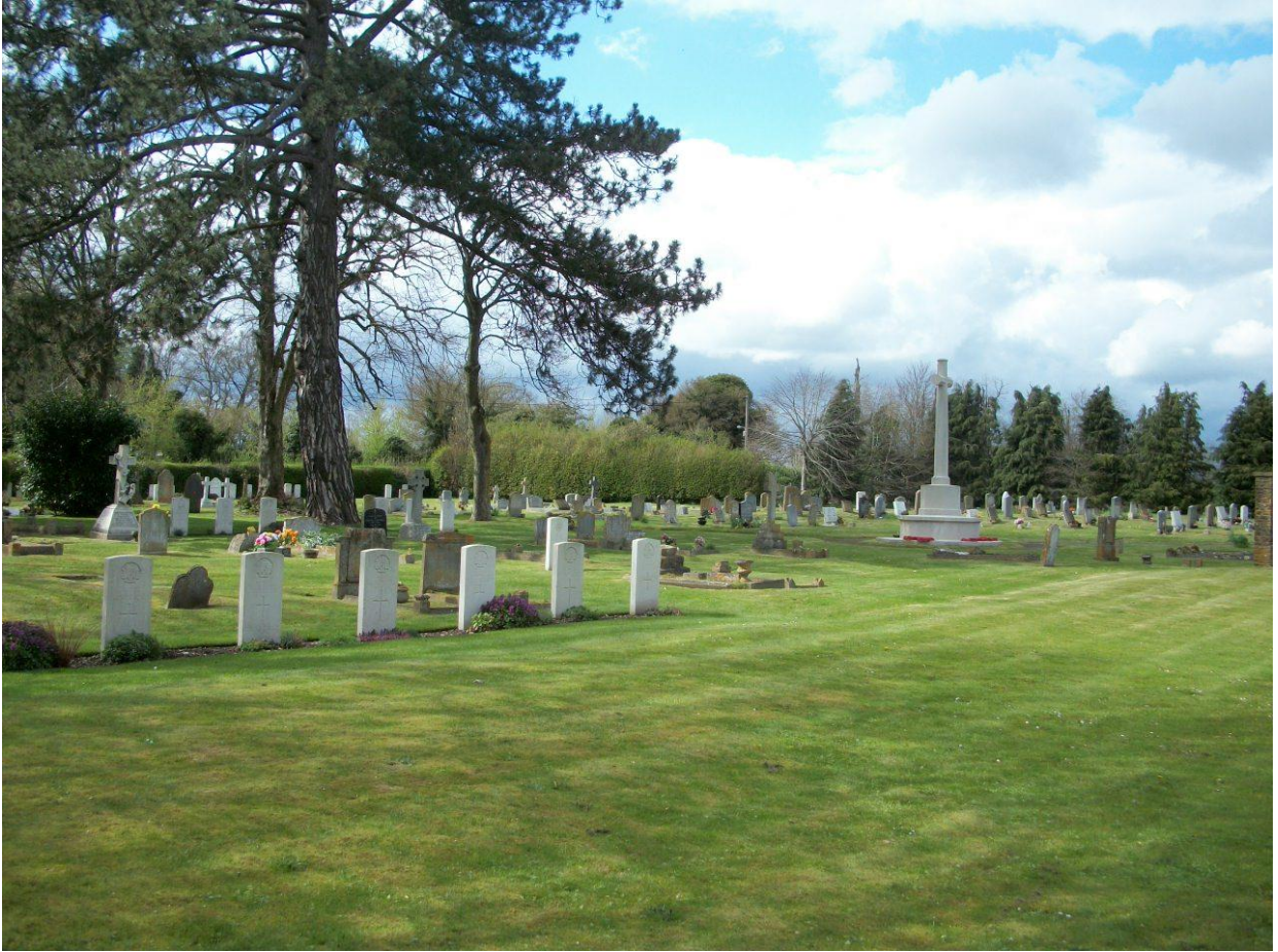
Bulford Church Cemetery